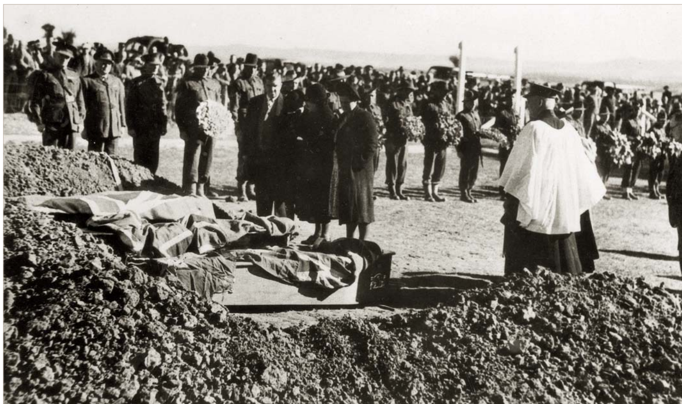
Burial of Australian soldiers killed during the breakout. Australian War Memorial, Image No 044119.