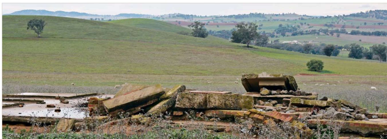
One of the scattered ruins left at the site of the Cowra POW camp.

and cultural swaps that have involved artwork, calligraphy, choirs, Catholic and Buddhist priests ... even lessons in having fun.