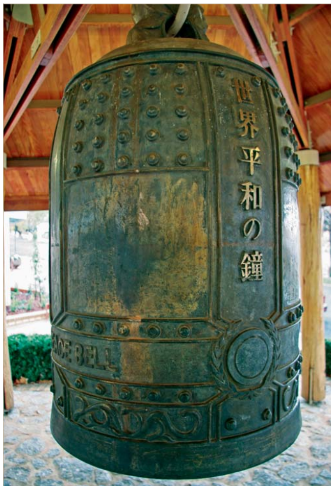
The Australian World Peace Bell, located in Cowra's civic square, was awarded to Cowra in 1992 for its contribution to the aims of world peace and international understanding.