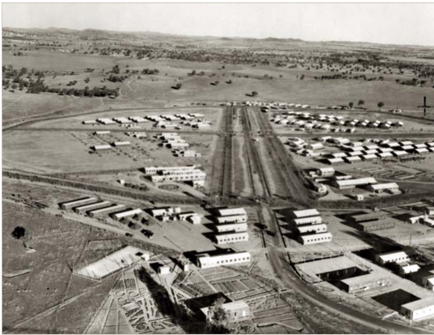
Aerial view of the Cowra POW camp taken the day after the breakout by Japanese prisoners. The camp, one of 28 POW camps in Australia during WWII, consisted of four compounds with a central strip known as 'Broadway': front right of Broadway is A Compound for Italian POWs, moving clockwise is B Compound for Japanese Other Ranks where all but three of 21 sleeping huts are burnt out, C Compound for Italian POWs, and D Compound for Japanese Officers, as well as Formosans and Koreans.

Australian soil in World War II. What mattered most to the locals was that there were enemy troops out there in the paddocks ... the paddocks of country Australia. And they were being stalked, mostly by untrained boy-soldiers, even by farmers with rifles and shotguns. The prisoners had stormed barbed-wire barricades around their prison, and now there were 334 of them roaming the surrounding areas. It would take nine days before they were all rounded up.