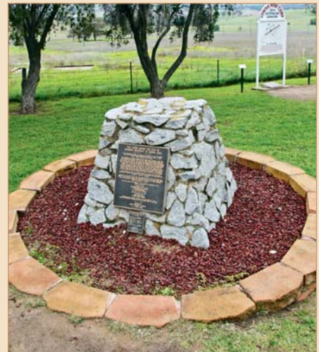
A monument marking the site of the breakout above the POW campsite.