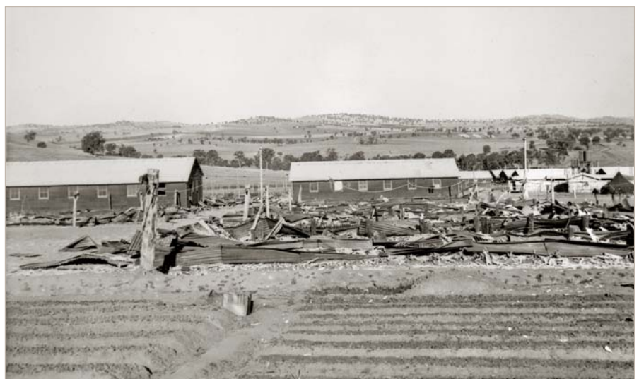
Cowra No 12 Prisoner of War Compound. Huts of the POW compound destroyed by fire after the mass escape in the early hours of 5 August 1944.

At the war's end, there was much animosity in Cowra, as elsewhere,